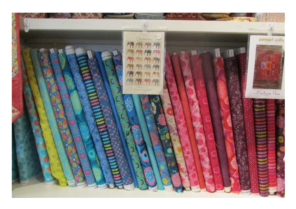
Crystal Manning by Moda