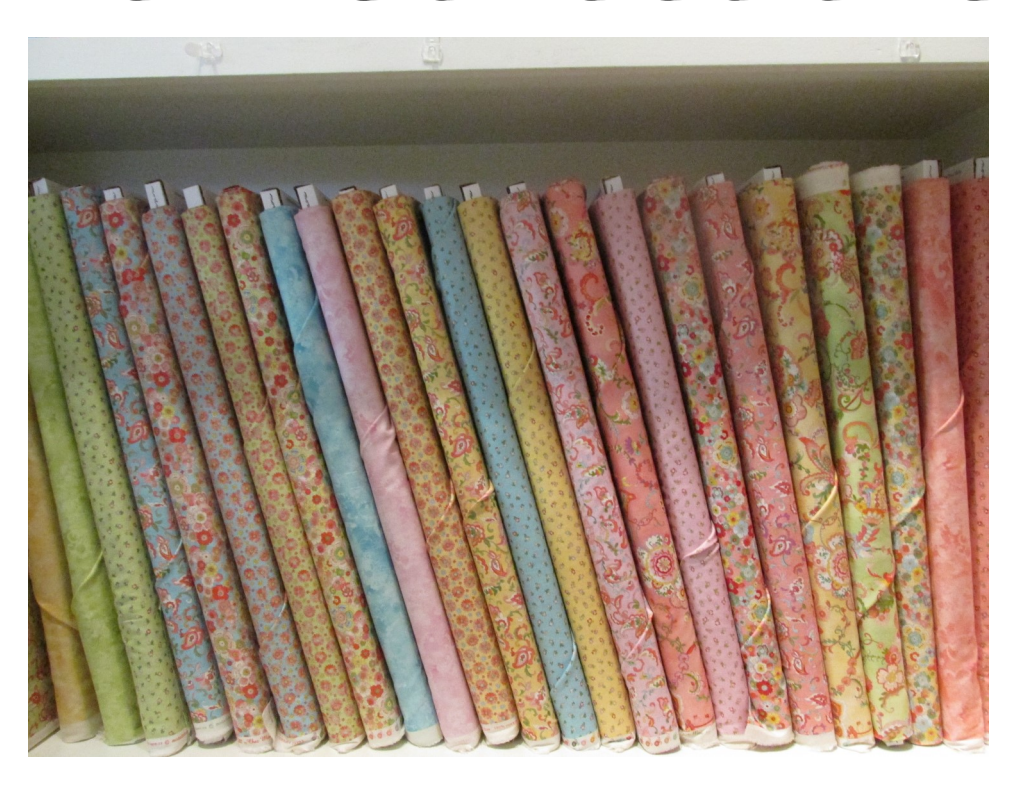
Coco by Chez Moi