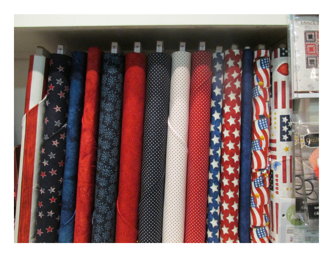
Celebrate America by Riley Blake